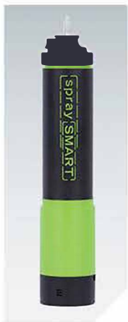
SpraySmart™ Device MR275124