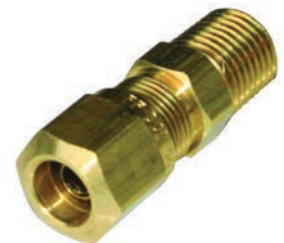
NTA 90° Male Elbow