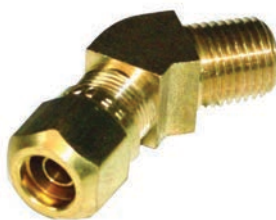
NTA 45° Male Elbow