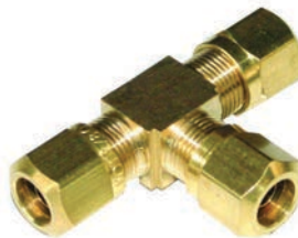
NTA Male Connector