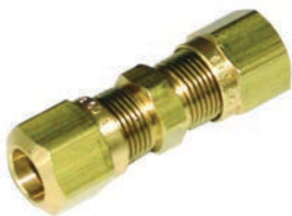
NTA Union Tee